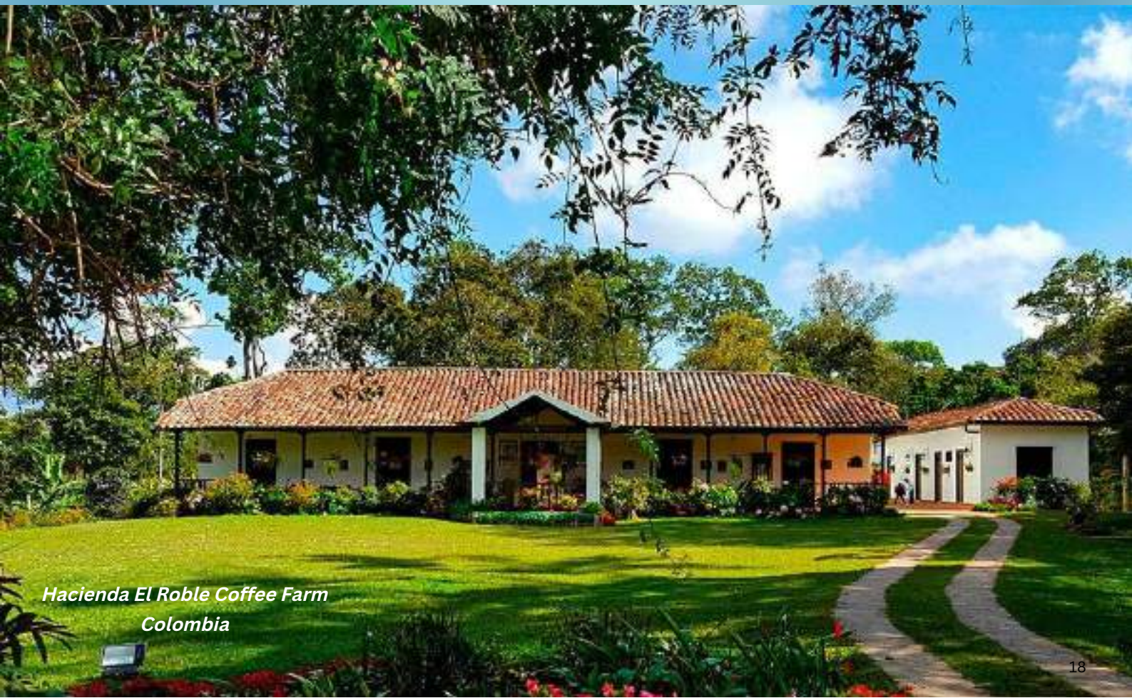
Hacienda El Roble Coffee Farm Colombia